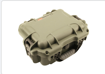
Optional Hard Case