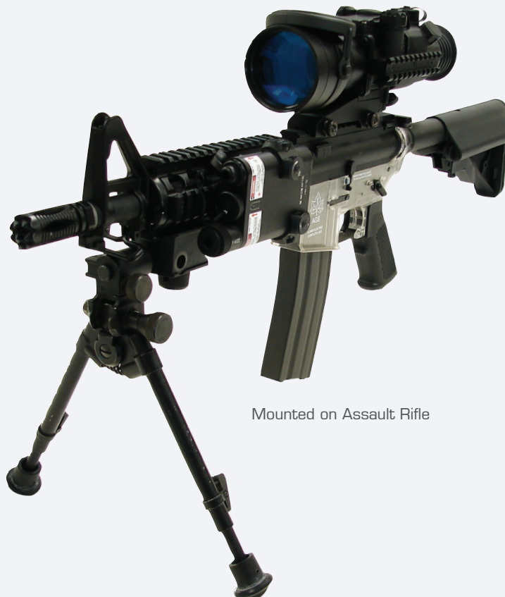
Mounted on Assault Rifle

LAM 2 IR INFRARED LASER AIMER / ILLUMINATOR